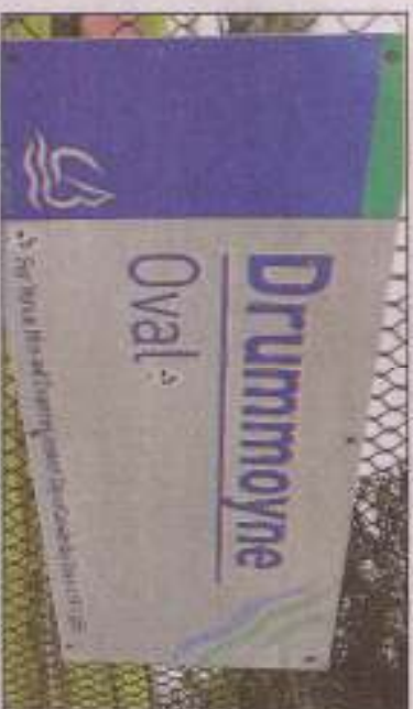
NAMING RIGHTS: Waitara Park and Drummoyne Oval are jockeying for the Mark Taylor stamp of approval.