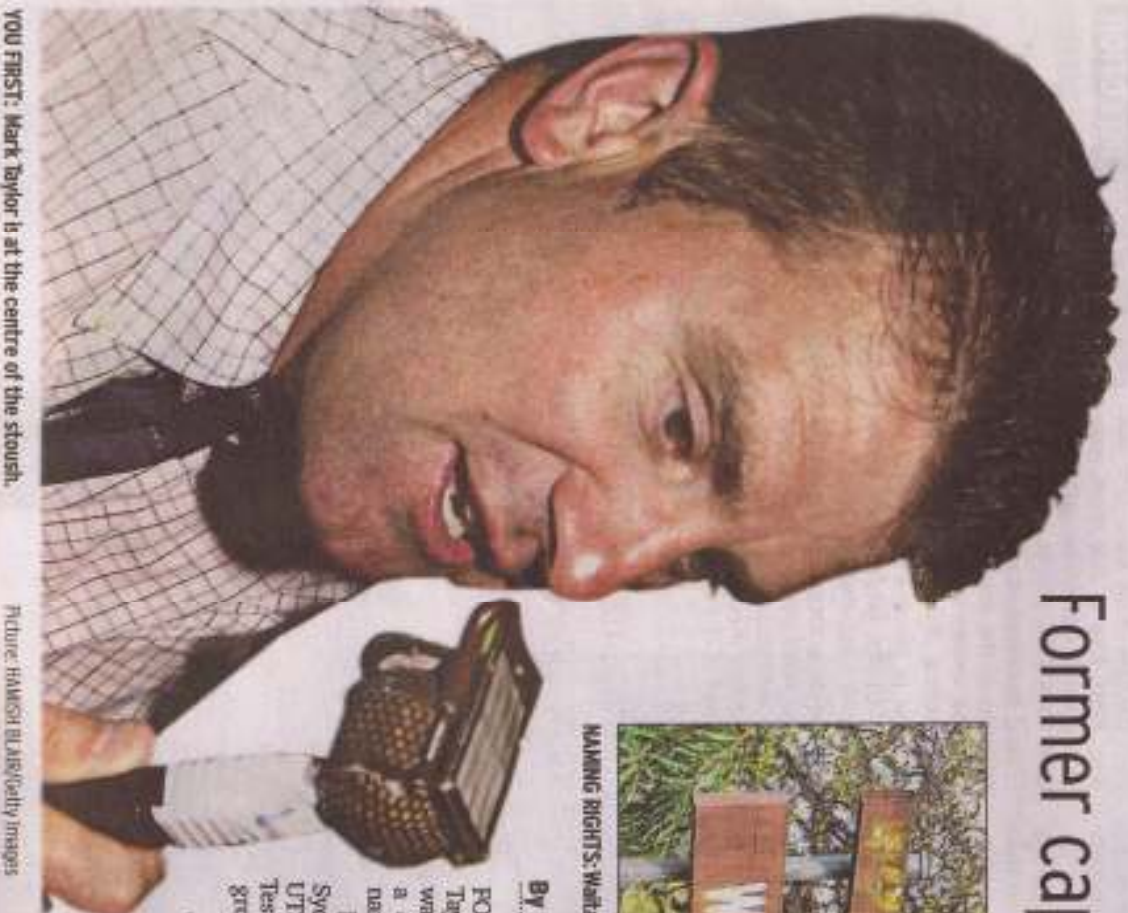
YOU FIRST: Mark Taylor is at the centre of the stoush.

One Mark Taylor Oval exists already - at Leeton, in southern NSW, where the Test great was born.